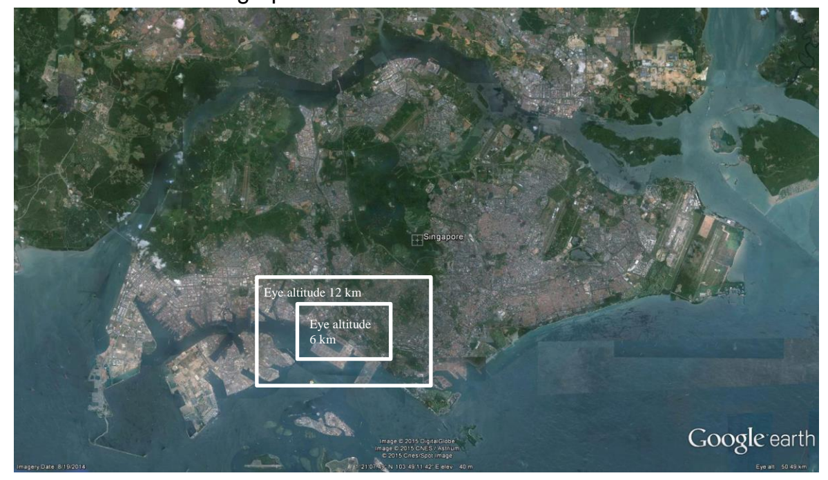
Fig. 2. Singapore Island is entirely visible at the eye altitude of 50 km. When zoomed in to the eye altitudes of 12 and 6 km, only a small part of the island is visible. At 6 km above in the clouds, the gathering together will be a colossal spectacle.

baptism, transfiguration, death and burial, resurrection, and ascension. In this motif, unique to the Messiah are the natural and supernatural signs in full panoramic view. In chronological order, the gathering together is the glorious appearance of Jesus Christ with His angels in the clouds, meeting of the resurrected saints with Christ, and catching-up of the living saints with Christ. Trails of evidence never seen before on earth will testify the resurrection and catching-up of the saints.