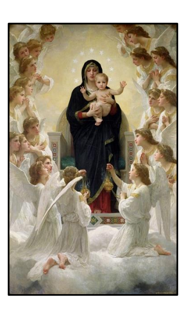
Adolphe-William Bouguereau 1900