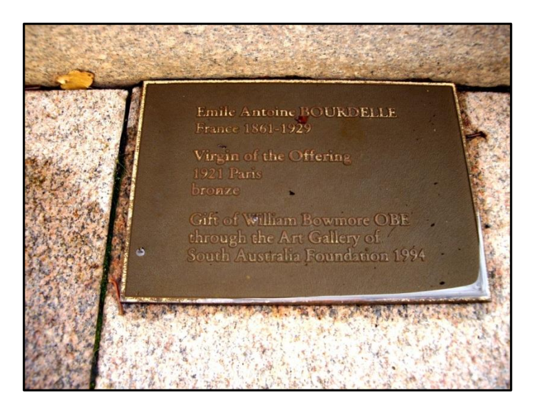
Figure 9 'Virgin of the Offering' Plaque -

Source: Google Images - http://www.mountharmonyfarm.com/GH-4Generations.html