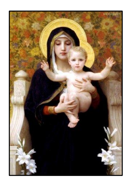
Adolphe-William Bouguereau 1889