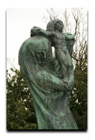
Figures 10 'Virgin of the Offering' (Three perspectives)