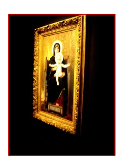
Figures 6 'Virgin and Child' (Three perspectives)