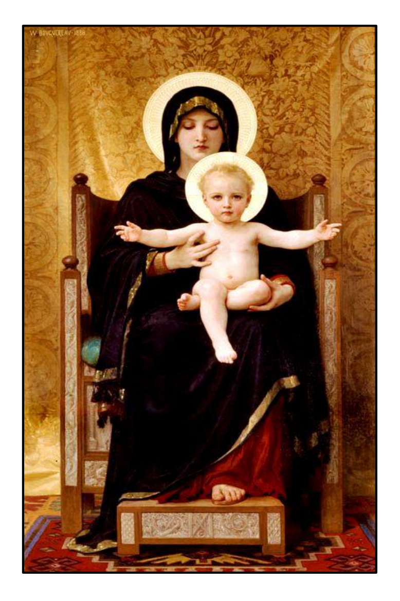
Figure 1 'Virgin & Child'

Bouguereau, Adolphe-William 'Virgin and Child' Oil on canvas,1888 176.5 x 103 cm (69 1/2 x 40 9/16 in.) Art Gallery of South Australia, Adelaide